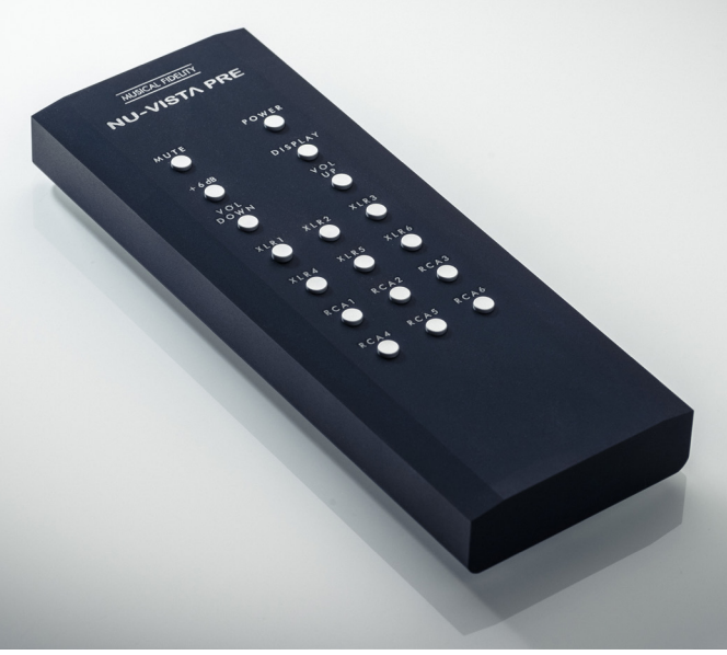
MUSICAL FIDELITY www.musicalfidelity.com