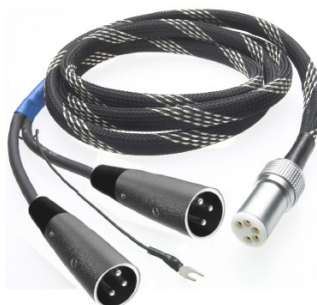
Connect it Phono DS 5P/XLR: separately available upgrade cable for True Balanced phono connections