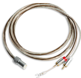
Connect it Phono E 5P/RCA included: Semi-balanced premium phono cable